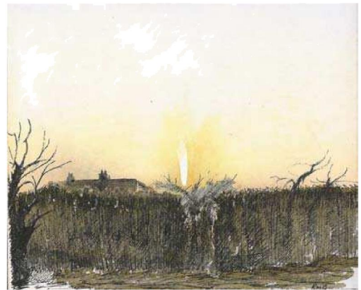
Comet West (1975a) viewed at dawn on 1976 March 2, with heavy frost and a clear, bright saffron sky. Three decades on, Richard wrote to one of the present authors: 'It was a wonderful morning. Not a cloud in sight, a wonderfully transparent sky after a hard white frost. Woke my usual time and dashed into garden and lo! there it was. All the family down in their night attire, straining to see the comet peeping just over the hedge... We even got out the step ladders! I've just rediscovered the rough watercolour I did that day. A fragment of time when all the world was sunny.'

In the late 1960s Richard, together with sev-