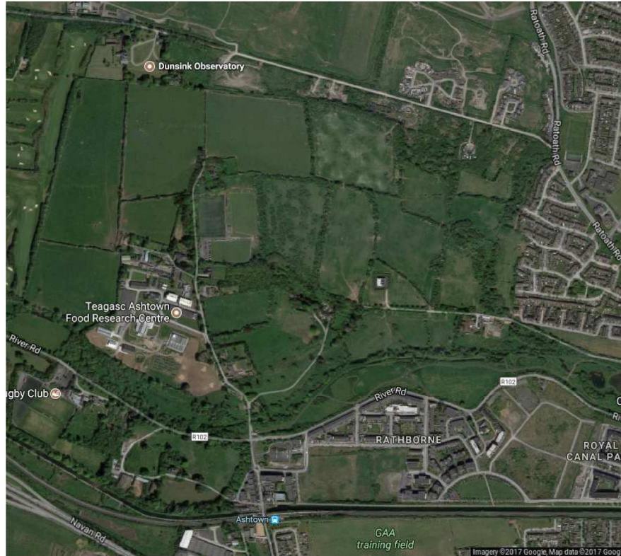
Figure 1 – In this Google Maps screen print north is up, west is to the left. Dunsink Observatory can be seen at the top, Dublin is located in the southeast but outside this map, the Royal Canal can be seen at the bottom. Walking north from the Ashtown Crossing on what is now Scribblestown Avenue, along what then was Dunsinea and now the Teagasc Ashtown Food Research Center, Hamilton entered the observatory grounds from the south.