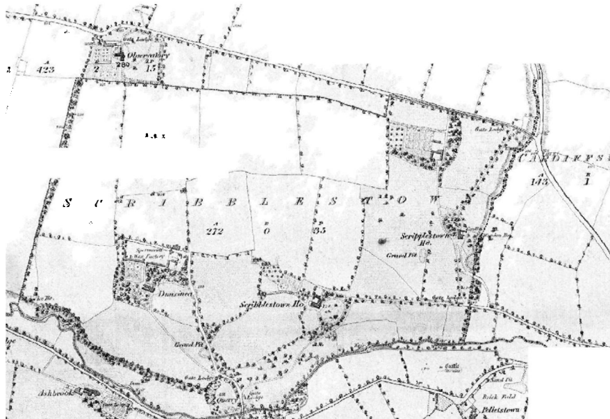
Figure 2 – This is a combination of four map sheets from the first Edition of the 1-inch Ordnance Survey , made between 1829 and 1842. In the map of Figure 1 the north, east and west borders are chosen to be equal to those in this map, but here the Royal Canal is not visible. Comparing the maps it can clearly be seen how many features of the grounds south of the observatory in Hamilton's days are still recognizable today. And how amazingly accurate the surveyors were. Dunsinea still seems to exist; if it is the same building indeed, the house now contains the Teagasc Ashtown National Food Centre Library.

See for these historical maps http://www.buildingsofireland.ie/cgi-bin/viewcounty.cgi?county=6 and http://maps.osi.ie/publicviewer/#V2,711016,738210,9,7 .