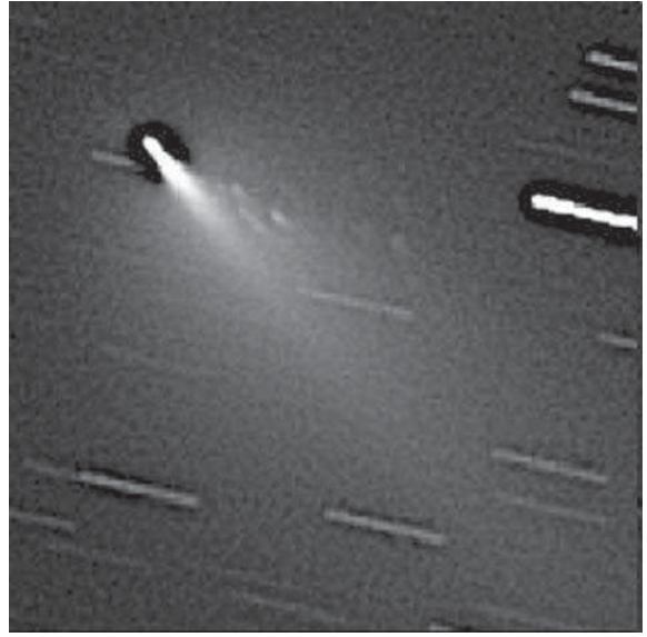
Comet 73P/Schwassmann-Wachmann 3 on 2006 May 6, leaving behind a shower of disintegrating fragments.

A mosaic of Spitzer Space Telescope images taken in 2006 May in the infrared showed the two main components C & B joined by an almost continuous thin band of light with dozens of fainter fragments strung out along the line. From one night to the next these fragments would brighten up or fade away and over the weeks leading up the close approach, taking images along this line revealed interesting details of this