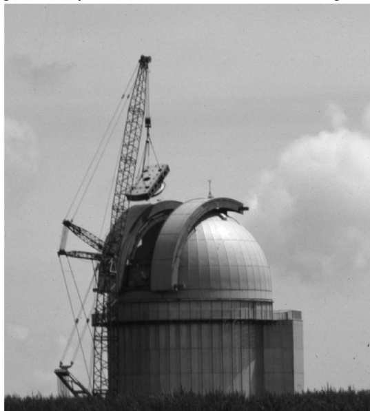
Fig. 2 The INT being dismantled for refurbishment by Grubb Parsons prior to its removal to La Palma.

The Isaac Newton Telescope was conceived and funded in 1946, in honour of the tercentenary of the birth of Sir Isaac Newton, which fell in January 1943 (December 1942 according to the Old Style calendar) but the celebrations for which had been postponed because of the Second World War. At the time, no large telescope to compete with the great reflectors of the western United States yet existed in the British Isles, and the idea was to build a large, world-class telescope to which all British professional astronomers would have access. Very early on in the telescope's history, it was decided to build it at Herstmonceux Castle in Sussex, the post-war site of the Royal Observatory (from 1948 known as the 'Royal Greenwich Observatory, Herstmonceux'). On its completion in 1967, it was the largest telescope in Western Europe. But the INT remained at Herstmonceux for just twelve years before it was dismantled and eventually rebuilt on La Palma in the Canary Islands. Herstmonceux, a few miles from the south coast of England, proved to be a very poor observing site for so large a telescope, and its productivity in terms of research results was meagre. 1