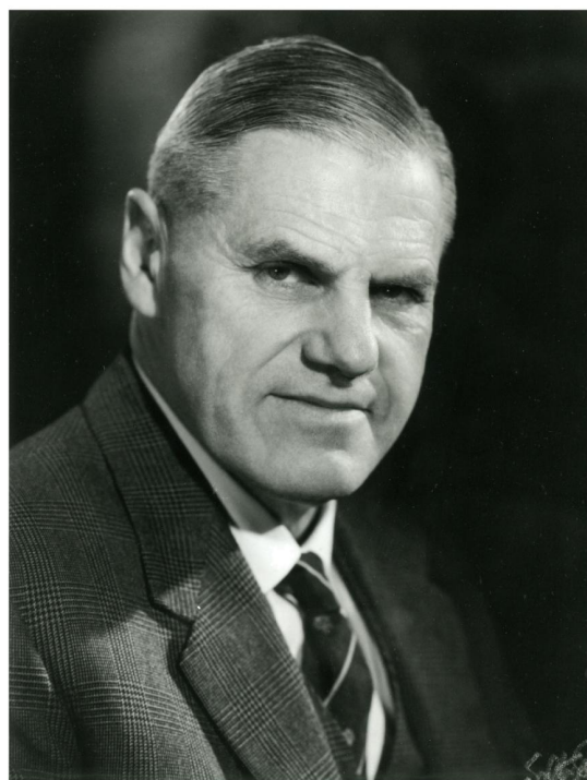
Fig. 5 Sir Richard van der Riet Woolley, Astronomer Royal from 1956 to 1971. As Chairman of the Isaac Newton Telescope Board of Management from 1956, he saw the project through to its completion in 1967.

By courtesy the Royal Astronomical Society.