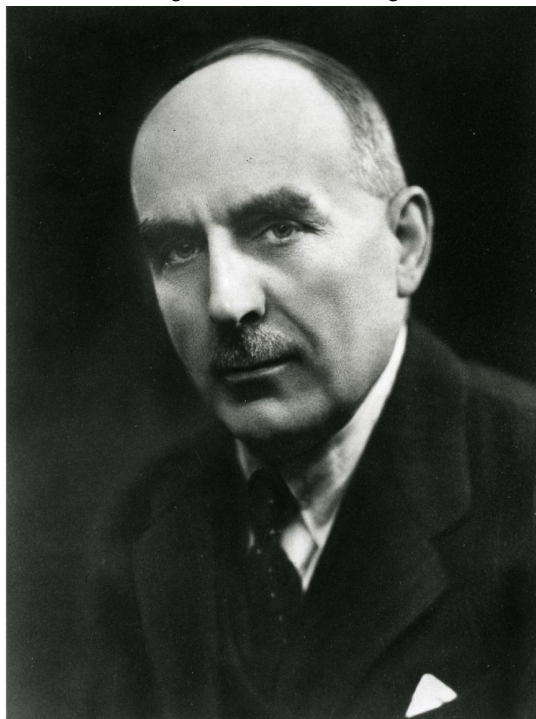
Fig. 4 Sir Harold Spencer Jones, Astronomer Royal from 1933 to 1955 and Chairman of the Isaac Newton Telescope Board of Management until his retirement in 1955.

Quite why an Astronomer Royal of the 1940s seriously considered a metal mirror is not clear, although it should be said that the idea may not be quite as ludicrous as it sounds, as some researchers around this time were looking into alternatives to glass for mak-