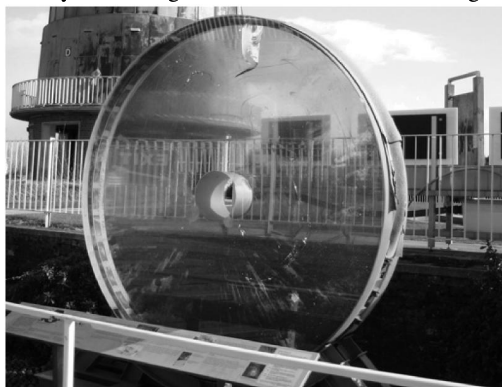
Fig. 3 INT Mirror Close Up: The original 98-inch Isaac Newton Telescope mirror, now on display at the Herstmonceux Science Centre. The reflective surface has been re-moved, allowing us to see into the glass. A number of flaws in the glass can be discerned in this photograph, though the large gash at the top is more likely to be subsequent damage.

98-inch mirror, the glass disc, or 'blank' which was of American origin and which was soon found to be of doubtful optical quality. When the INT was re-erected at La Palma, it was equipped with a new mirror, and the original mirror, with its reflective coating removed, is now on public display at the Herstmonceux Science Centre. As we shall see, concerns about the mirror's quality more than once came close to fundamentally changing the course of the whole INT project – indeed, in one sense, they actually did so, in that the original mirror had a focal ratio of f/3 , very fast for Cassegrain telescopes of the day, causing the present-day INT on La Palma, which has the same tube as the Herstmonceux instrument, to have the same compact f /ratio. Here I shall describe the history of the original 98-inch mirror, examining how