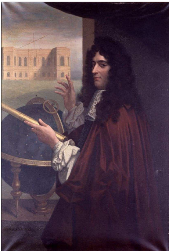
Figure 3: Jean-Dominique Cassini, by Léopold Durangel (1879), from an old engraving. The Paris Observatory is on the background, with one of the long refracting telescopes used by Cassini, placed here by mistake on the roof of the building.

which the perfection of geography and navigation depends. They estimated that one would have a fast and secure way to determine longitudes, if one could find in the sky some rapid phenomenon which could be observed at the same time from very distant points on the Earth. This being assumed, comparing with each other the times of observations done simultaneously in different locations distant from each other from the East to the West, it would be easy to know by how much one of these places is more to the East than the other; which indicates their difference in longitude. (Cassini, 1692: 1-2; our translation)