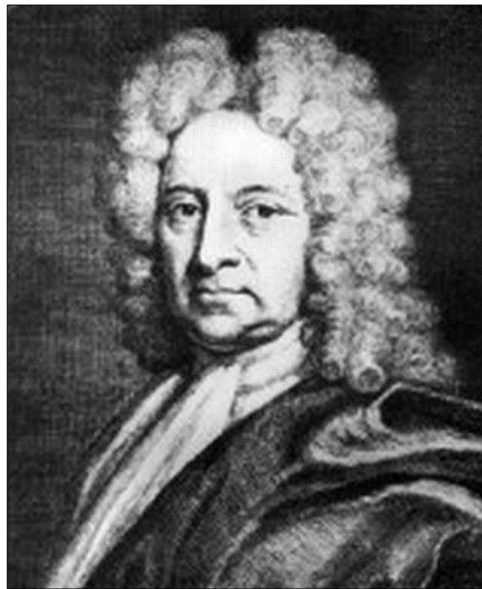
Figure 5: Edmond Halley.

The English astronomer Edmond Halley (1656–1742) is well known for having shown that the comet to which his name has been given reappears regularly every 76 years or so. Halley (Figure 5) knew Cassini very well, and visited him at the Paris Observatory during the first months of 1681. 10 Halley was thus very aware of the work carried out at the Observatory on the satellites of Jupiter. In 1694, he published an adaptation for London of Cassini's new ephemerides for Jupiter's satellites (Halley, 1694). He acknowledged that they were rather exact, but he made important criticisms.