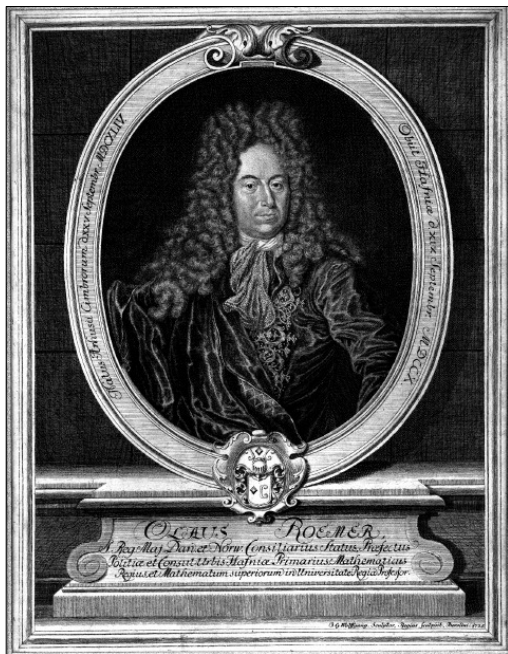
Figure 1: Ole Rømer, engraving by J.G. Wolfgang (1735). Rømer appears here in full glory. After his return to Denmark, around 1681, he became Mayor and head of the police of Copenhagen, and also head of the State Council of the Realm (Library of the Paris Observatory).

The discovery of the finite nature of the velocity of light has been abundantly commented on by many authors. The general opinion is that it is due to Ole (or Olaus) Rømer (Figure 1), 1 who published it on 7 December 1676 in the Journal des Sçavans . The paper by Rømer (1676), well-written and very clear, shows that the discovery was made while studying the motion of the first Galilean satellite of Jupiter, Io (Figure 2). There is, however, some doubt about this discovery, which we will now try to dissipate. Before this, let us examine why the satellites of Jupiter were so actively observed during the seventeenth century.