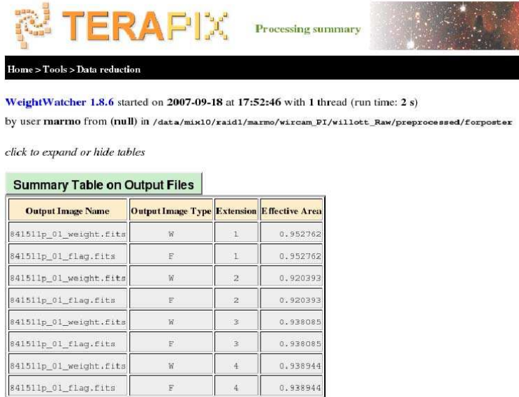
Figure 3. XSLT translation of the XML-VOTable output of Weight-Watcher. This XSLT filter is provided in the public distribution.

The unflagged area useful for science is computed and printed to the XML output file.