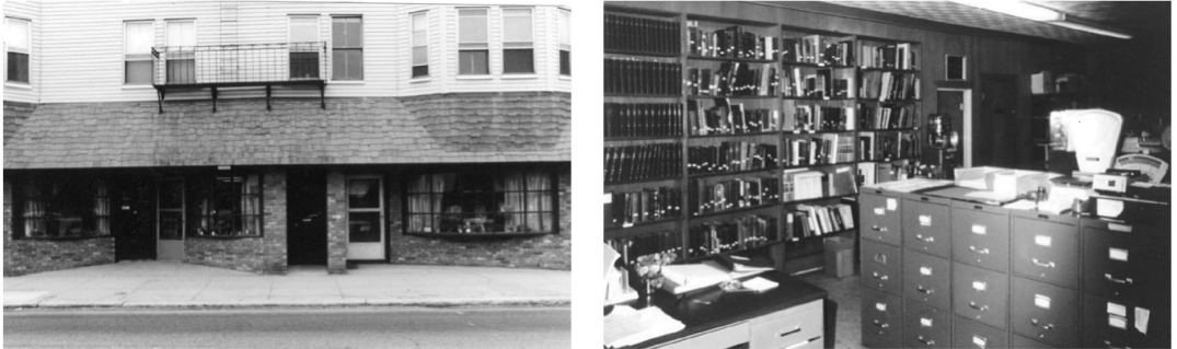
Figure 4. AAVSO Headquarters at 187–189 Concord Avenue comprised adjacent storefront offices (shown on the exterior photo at left). The “front office” (shown at right) was accessed via the right-hand storefront.

The AAVSO's third official Headquarters (Figure 4) was only 600 feet west of HCO. A happy convenience in that it brought Margaret and her staff close to the Harvard astronomers, the astronomy library, and the Sky Publishing Corporation offices (publisher of Sky & Telescope then located in HCO's Building D).