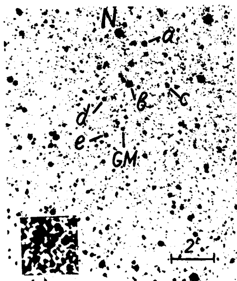
Figure 2. Visual chart of GM Sgr. Lower left is a 2'x2' fragment of the blue Palomar Sky Survey chart. Image of GM Sgr is in the center. Photographic magnitudes of comparison stars are the following: b=12.90 , c=13.71 , d=14.48 , e=15.43 .

hours in a night. A final choice of the orbital period can be made by monitoring at southern observatories.