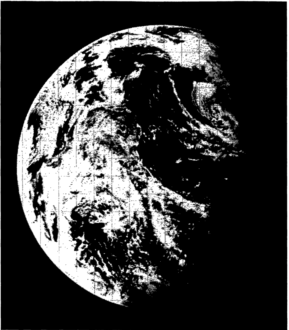
Fig. 3. Apollo photograph of the Earth taken at very roughly the same phase angle as the drawing of Venus in Figure 2. The Earth shows about 50% cloud cover.

in altitude of the respective landing sites of many kilometers. This appears to be inconsistent with the time delay radar measurements of topography performed at Lincoln Laboratory (Smith et al. , 1970), but the lateral resolution of the ground-based radar is some hundreds of kilometers; perhaps at a much smaller lateral resolution scale the topography is rougher. Why Venus should be rotating in a retrograde direction, why it should be locked or almost locked in rotation at moments to inferior conjunction with the earth (see, e.g., Gold and Soter, 1969), and why the clouds of Venus show a four day retrograde rotation are clearly important problems which are