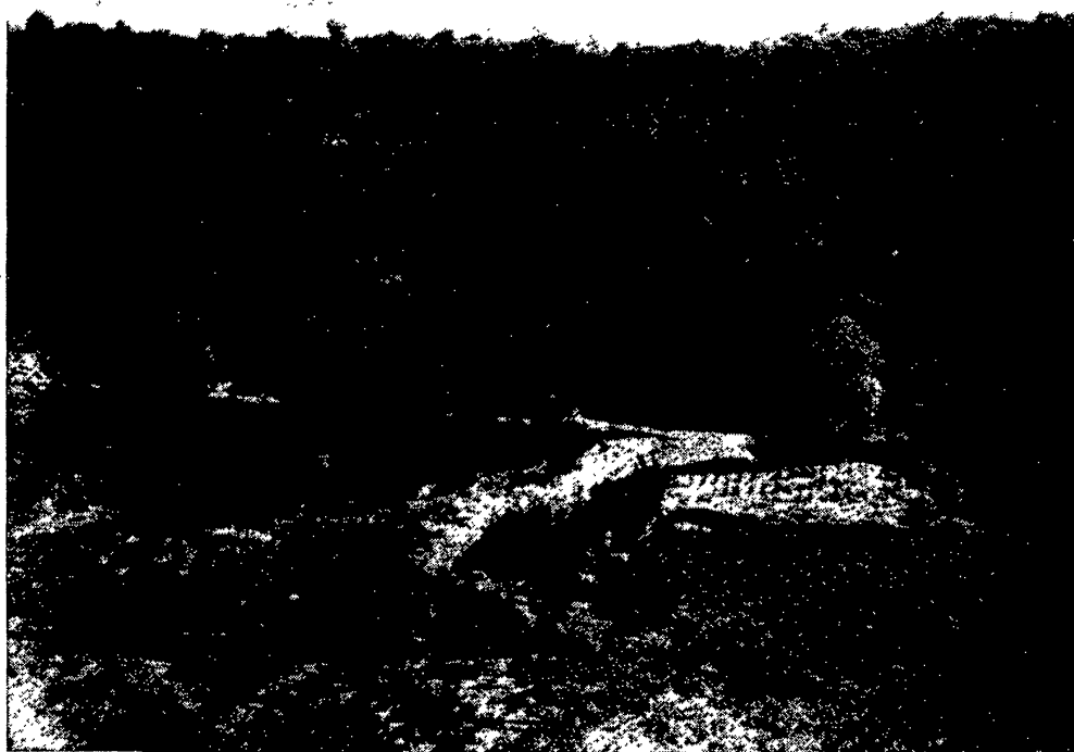
FIG. 2.—The interior of the Cambrerolles Crater.

of the trees to the height of the slope gives a fairly good impression of the size of the crater.