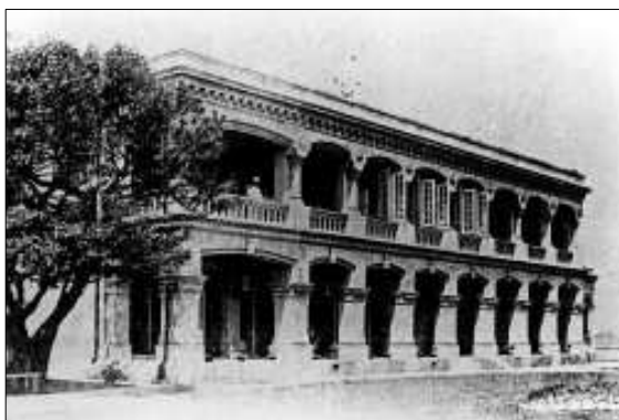
Figure 4: Close-up of the 1883 Hong Kong Observatory building, taken in 1913.

Let us briefly take a look at the background to the new institution that Doberck was about to lead. Within the first thirty years of the setting up of the Colony of Hong Kong its commercial importance grew significantly, and this attracted increasing numbers of vessels to the port. Consequently, there was soon a need for a reliable time service, and the demand for a time-ball justified the setting up of an observatory. The depredations wrought on the Colony by unannounced typhoons, and the extent to which the effects of these could be ameliorated—as evidenced by the warnings heeded in the Bay of Bengal and, after 1880, by warnings issued from the observatory in Manila—were yet another justification for such a proposal. Finally, the Royal Society in London was keen to monitor geophysical phenomena, and particularly geomagnetic variations, on a global scale and by establishing an observatory in Hong Kong a major gap in the coverage would be plugged.