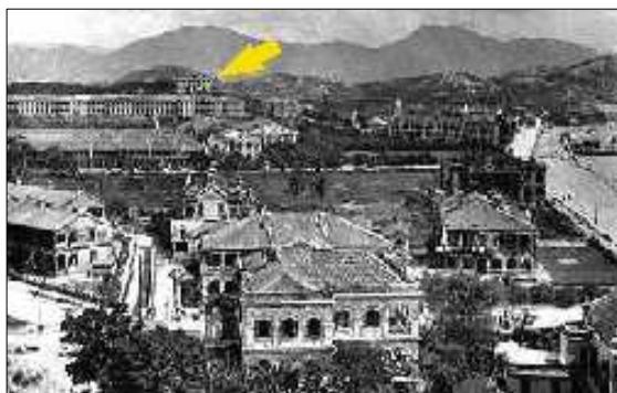
Figure 3: Panoramic view across the Tsim Sha Tsui area showing the Hong Kong Observatory (yellow arrow), high on the hillside above the harbour.

It would be some time before Doberck could return to these double star studies, but return he eventually did, both in Hong Kong and later, during his retirement, in England.