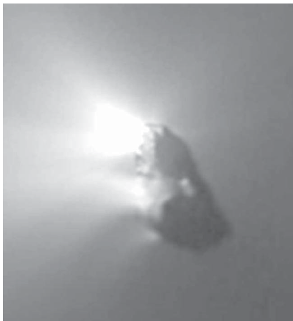
Figure 6. The heart of the Star of Bethlehem?

astrologically significant is not ruled out as the basis of any such oral stories. What is ruled out is any causal relationship between such an event and the birth of Christ.