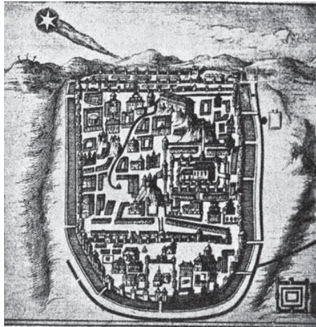
Figure 1. The comet 'hung over' Jerusalem in AD 66. From Stanislaw Lubieniecki, Theatrum Cometicum , 1681 edition.

Another interpretation of the meaning of Matthew introducing the Magi was to show good triumphing over evil. The sorcer-