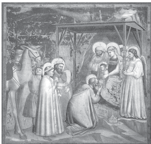
Figure 4. The Adoration of the Magi by Giotto di Bondone (Scrovegni Chapel, Padua).

It is reputed, though this has been questioned, 34 that another apparition of Halley's Comet inspired Giotto di Bondone in 1301 to depict it as the Star of Bethlehem in his fresco 'The Adoration of the Magi' 35 (Figure 4). The comet should have been an even better spectacle to Matthew than to Giotto. For reference, the 1986 apparition in the northern hemisphere was the faintest 36 for over 2,000 years.