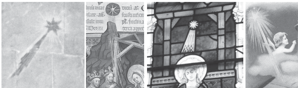
Figure 5. Examples of the Star of Bethlehem depicted as a comet in art. Left to right: from a painting in a side chapel in the Mezquita, Cordoba; from a 15th century illuminated manuscript by Martin of Aragon ( Bibliothèque Nationale de France ); a 19th century stained glass window in the parish church at Dunster, Somerset; from a 20th century Christmas card.

Matthew may have invented the star completely or it may have been based on oral stories of some manifestation in the heavens that occurred by chance at around the same time. The original stories, if such existed, could have been based on a different astronomical event or events. Such stories would have been based on something significant. This significance could either have been astronomical or astrological or both. The event didn't even necessarily have to be one based on a star. Consequently a conjunction that is