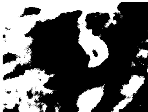
FIG. 3. Enlarged portion of Apollo 16 metric frame 3008 showing Giordano Bruno.